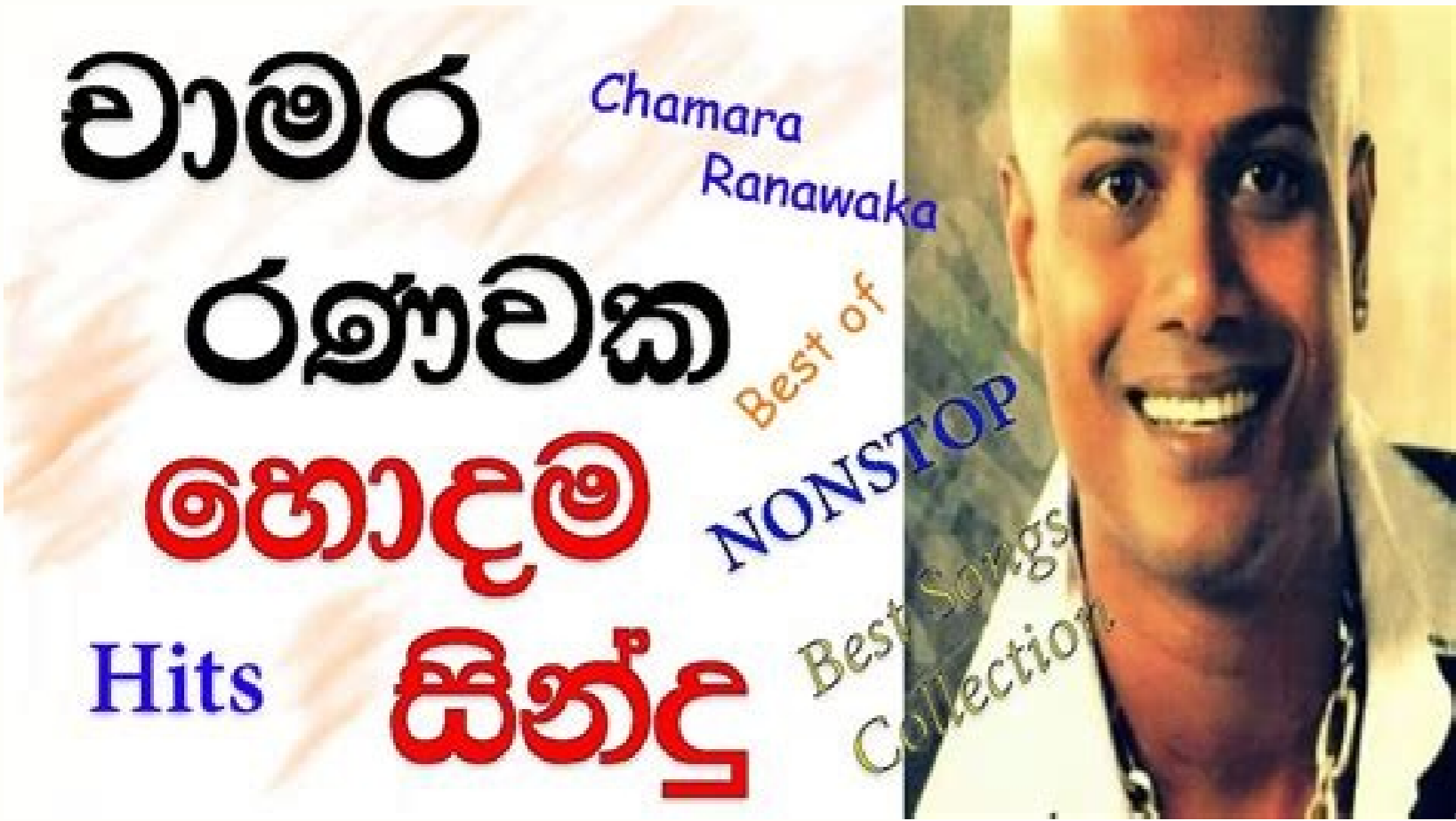
Chamara ranawaka best songs download. Famous songs with chorus. Most popular king gizzard song. Famous chopin tunes. Famous copied songs.